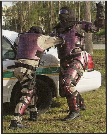
Learning a defensive tactics skill using the Redman® weapons defense training suit.

Third, the very tactics these shooting schools are teaching to civilians are wrong. Usually, these schools cover the tireless combat shooting triad which is: marksmanship (the shooters ability to hit the target quickly), tactics (the use of position, cover and concealment), and weapon presentation (the draw and handling of the weapon including reloading skills).