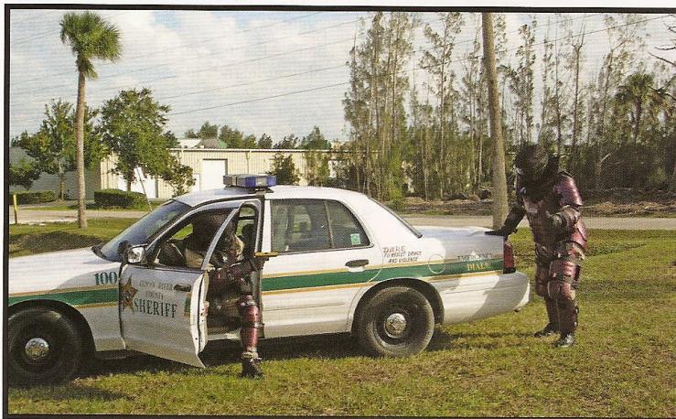
Instead of a law enforcement scenario, imagine this as a counter carjack scenario.

As another point of interest: when was the last time you ever saw an instructor have a student on the line with a shoulder holster? How about a purse? Or how about drawing a gun from the pants pocket? They don't because they think that's not a practical way to carry, but for whom? That's right friends, for law enforcement and military that's who. And yet these are the very applications in which ordinary citizens carry their weapons on their person every day.