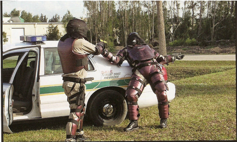
Now, imagine utilizing your firearm at real speed under realistic conditions.

What's wrong with that you ask? Most shooting schools have students